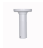
PB02 Pendant Mount